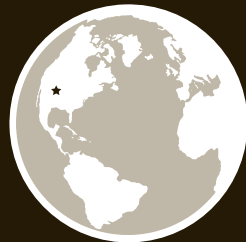
Exhibit & Sponsor Prospectus